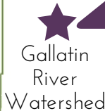
Gallatin River Watershed